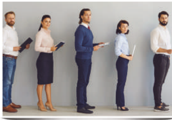
Manpower Planning, Recruitment and Selection