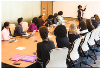
Training and Development Strategy