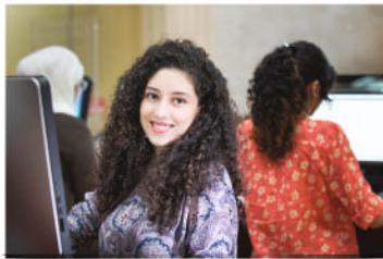
Information Technology for Management