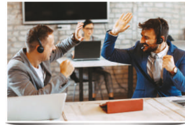
Performance Management System