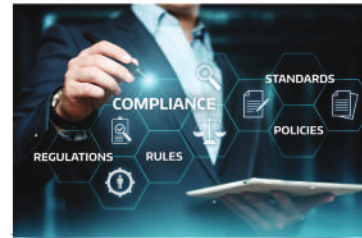
Industrial Relations & Labor Laws