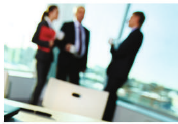
Business Communication Skill