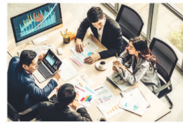
Basics of Digital Marketing