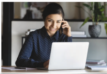
Office Practice and Procedure

Ministry of Electronics & Information Technology (MeitY), Government of India