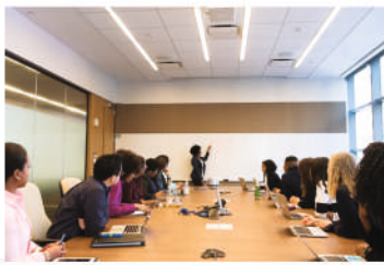
Basics of HR Management

This program will develop and maximise your potential to be a productive and professional administrator, who is able to perform the job effectively and contribute to the success of any organisation.